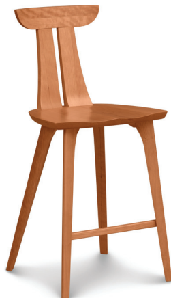
Estelle Counter Stool - seat height 26" 8-EST-60-XX 19 3/4"w x 20"l x 41 1/2"h