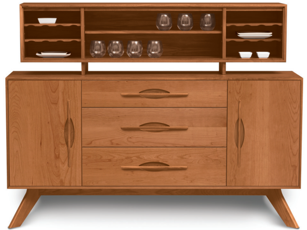
1 Door on either side of 3 Drawers Buffet