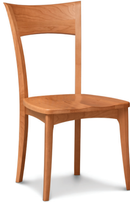
Ingrid Sidechair - Wood Seat 8-ING-21-XX 19 3/4"w x 22"l x 37 1/2"h