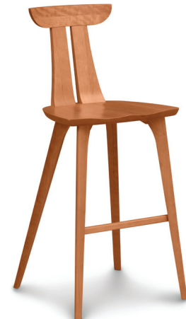
Estelle Bar Stool - seat height 30" 8-EST-65-XX 19 3/4"w x 20"l x 45 1/2"h