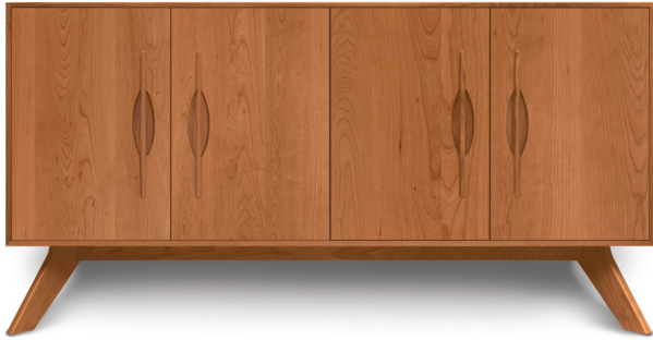
4 Door Buffet

Buffets are available in four configurations to serve a wide range of storage needs. Hutch incorporates adjustable/removable shelves for wine bottle and stemware storage.