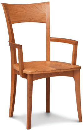
Ingrid Armchair - Wood Seat 8-ING-23-XX 21 1/2"w x 22"l x 37 1/2"h