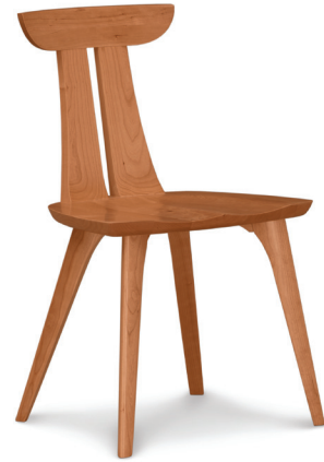
Estelle Chair 8-EST-50-XX 19 3/4"w x 20"l x 33 3/4"h