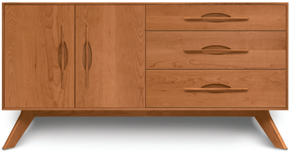
3 Drawers on Right, 2 Doors on Left Buffet