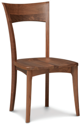
Ingrid Sidechair - Wood Seat 8-ING-21-04