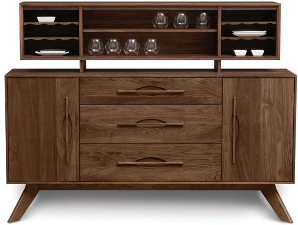
1 Door on either side of 3 Drawers Buffet 6-AUD-50-04 66 1/8"w x 18"l x 33 7/8"h Hutch 6-CAL-75-04 60"w x 12"l x 16"h