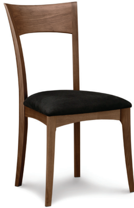
Ingrid Sidechair - Upholstered Seat 8-ING-20-04