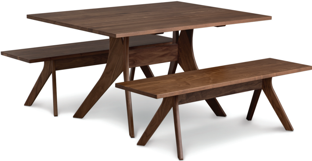
40" x 72" TABLE 6-AUD-10-04 40"w x 72"l x 30"h