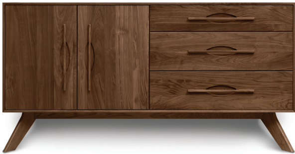
3 Drawers on Right, 2 Doors on Left Buffet 6-AUD-51-04 66 1/8"w x 18"l x 33 7/8"h