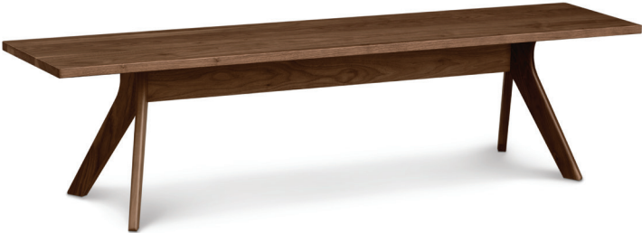
60" BENCH 8-AUD-06-04 60"w x 17 3/4"l x 17 1/2"h