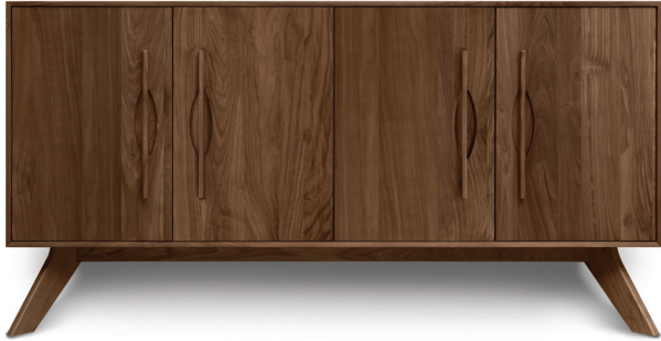
4 Door Buffet 6-AUD-40-04 66 1/8"w x 18"l x 33 7/8"h

Buffets are available in four configurations to serve a wide range of storage needs. Hutch incorporates adjustable/removable shelves for wine bottle and stemware storage.