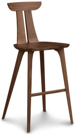
Estelle Bar Stool - seat height 30" 8-EST-65-04