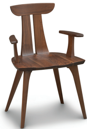
Estelle Arm Chair 8-EST-52-04