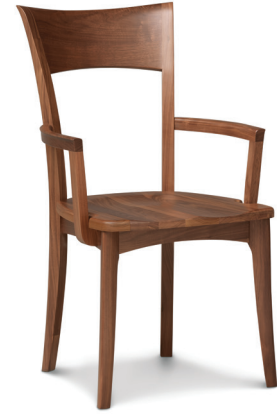
Ingrid Armchair - Wood Seat 8-ING-23-04