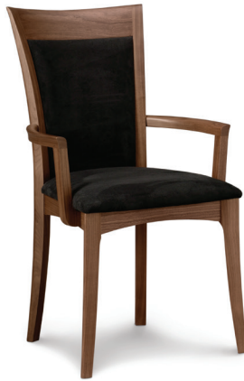
Morgan Armchair 8-MOR-32-04