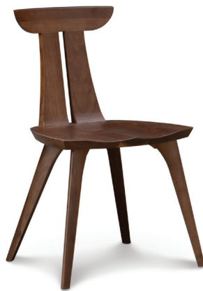
Estelle Side Chair 8-EST-50-04