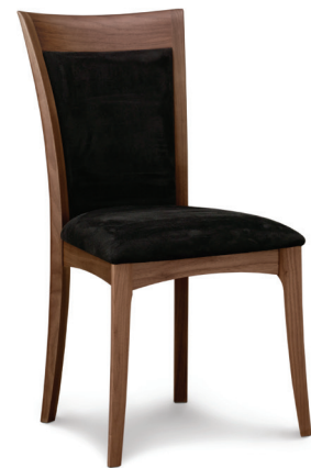
Morgan Sidechair 8-MOR-30-04