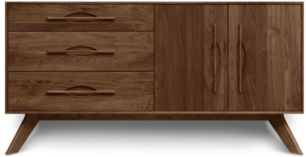
3 Drawers on Left, 2 Doors on Right Buffet 6-AUD-52-04 66 1/8"w x 18"l x 33 7/8"h